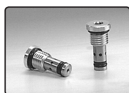
CP-104 - Load Sense Check Valves Available Separately